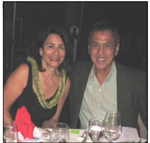
Skal Hawaii's out-going Officers and Board of Directors